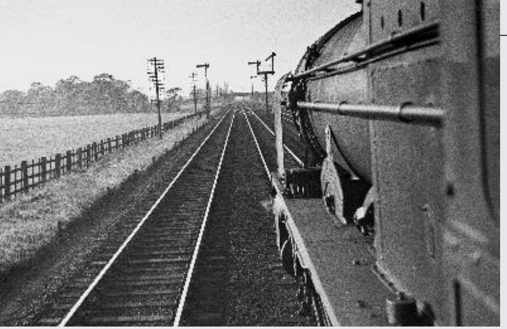
The view from the driver's side of an unrebuilt 'Royal Scot' 4-6-0 No.6137 The Prince of Wales's Volunteers (South Lancashire) heading an up express on the four-track stretch north of Crewe.

mongst the ranks of railway photographers there was probably no-one better known and respected than Eric Treacy. More than any other, his work portrayed the sheer drama and 'full-on' action of steam locomotives at work. His skills were first learned in Liverpool to where his calling had led him.