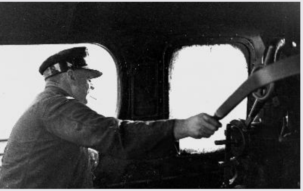
Driving a 'Royal Scot', No.6137, on a Liverpool to Crewe turn.

Brand-new Pacific No.6202 — the 'Turbomotive' — attracts the scrutiny of railwaymen at Liverpool Lime Street as it awaits departure on a running-in turn, the 12 noon Liverpool–Plymouth. The first coach is a GWR vehicle.